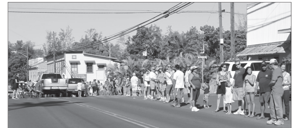
A "human chain" was formed in Kapaau town to pass the books 1 ¼ miles from the old library to the new North Kohala Public Library on October 23.