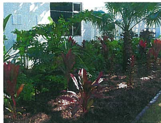
The finished landscape!