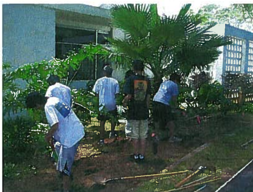
Troup 35 hard at work