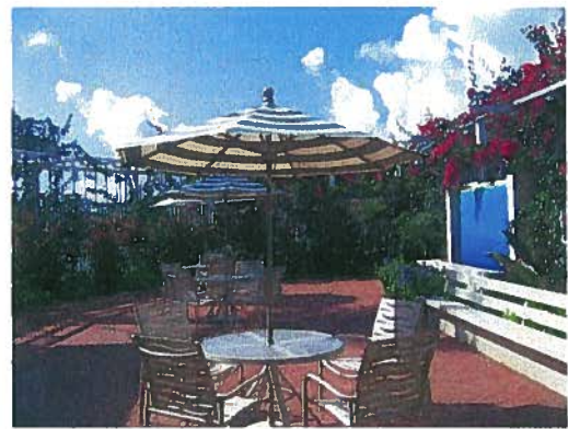
The Courtyard 2008