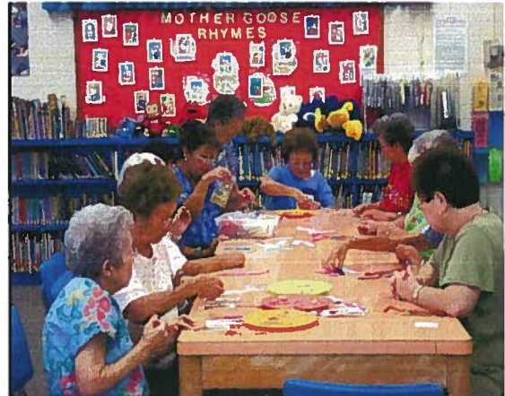
Oshibana bookmark making with Hanapepe Seniors Center

Improvements continue to be made to our library facility. Work is scheduled to begin within the next few months to install a photovoltaic system on our roof and the main library will be reroofed. The library has also been fitted for flood gates which will be installed at entrances whenever there is a tsunami or hurricane.