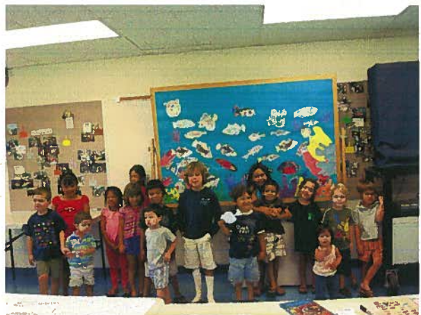
Young artists build a coral reef mural

393 readers participated in this year's Summer Reading Programs, reading a total of 6,031 books. Our children loved receiving their free books donated by the First Book program and teens and adults were delighted to receive a "Hawaii Warrior Football" or "Iz" book donated by Bess Press. In addition to the wonderful prizes provided statewide by the Friends of the Library of Hawaii and community sponsors, we were fortunate to receive support from local business and the Friends of Hanapepe Public Library. Lappert's Kauai generously donated 200 waffle cone coupons for our participants and Borders Books and Music Kauai donated "New Moon" items, sundry kits, games and greeting cards for Kauai Library District. Upon receiving her prize, one adult participant commented, "Now I know why my children get so excited about reading every summer!"