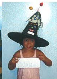
Halloween Hat Decorating