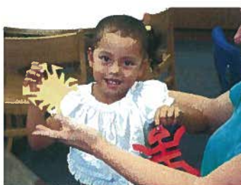
Folk Art of Chinese Paper Cutting

Thanks to the generosity of the Friends of the Library of Hawaii and Maui Friends of the Library, we were able to present various educational and recreational programs for all ages.