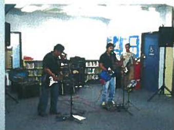
YA SRP Reading Rocks Concert