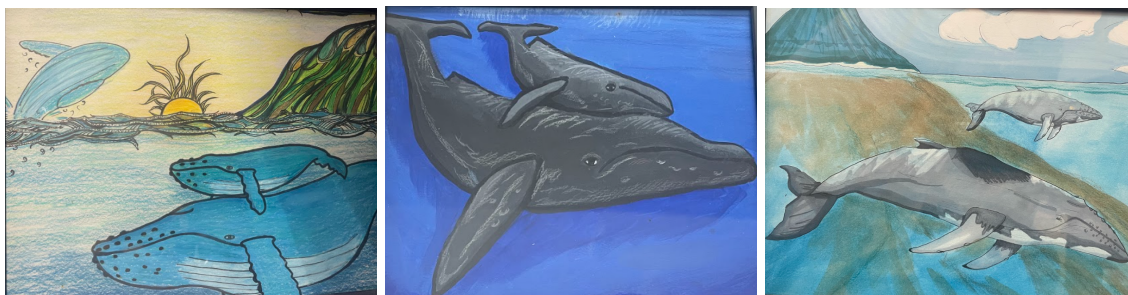
Examples of previous Welcome Back Whale Celebration posters.

Fill out this Google Form to enter your masterpiece. We look forward to seeing your amazing artwork!